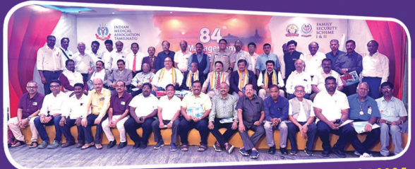
FSS Management Committee Meeting at Kanyakumari on 11.05.2025