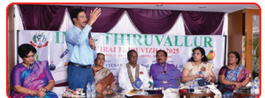
IMA Thiruvallur Branch