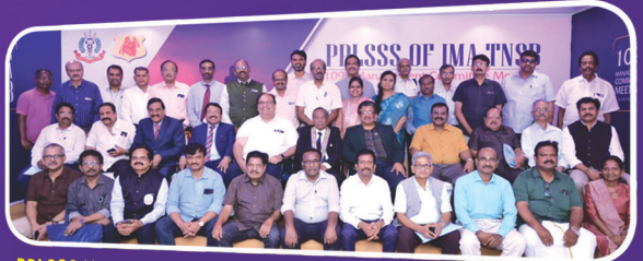
PPLSSS Management Committee Meeting at Kanyakumari on 10.05.2025