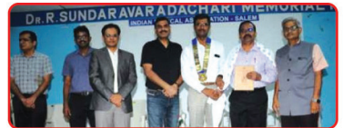
IMA Salem Branch