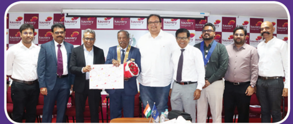
Inauguration of New IMA Branch - IMA Chennai Kauvery Vadapalani Branch on 15.05.2025