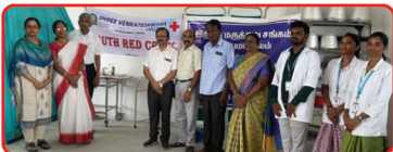
IMA Sathyamangalam Branch