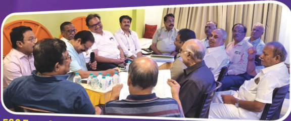
FSS Trust Board Meeting at Kanyakumari on 11.05.2025