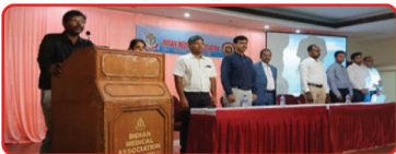
IMA Tiruchirapalli Branch