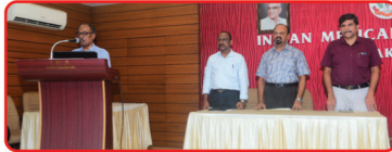
IMA Kanyakumari Branch