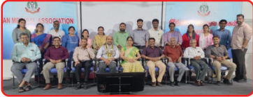
IMA Chennai Tambaram Branch