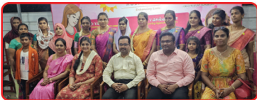
IMA Pulaingudi Branch