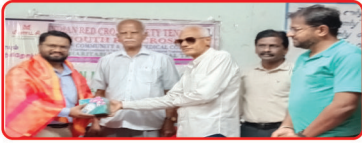
IMA Ambasamudram Branch