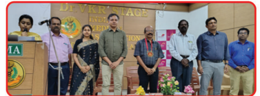
IMA Pudukottai Branch