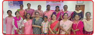
IMA Krishnagiri Branch