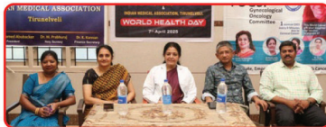
IMA Tirunelveli Branch