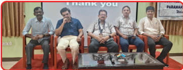
IMA Paramakudi Branch