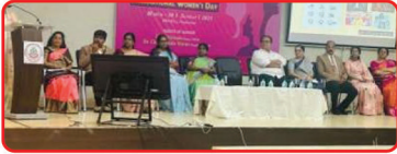
IMA Coimbatore Branch