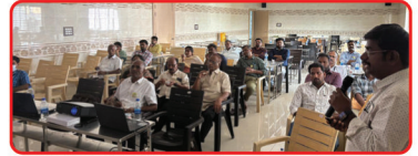
IMA Harur - Uthangarai Branch