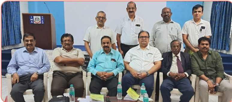
Constitution Amendment Committee Meeting at Salem on 26.04.2025

On April 26, I had the honour of attending the State Conference of the Tamil Nadu Federation of Obstetricians and Gynaecologists held at Salem as a Guest of Honour. On the same day, the