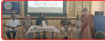
IMA Batlagundu Branch