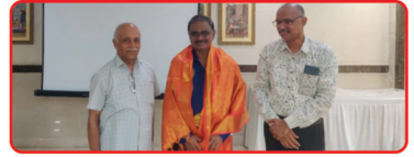
IMA Chennai Kodambakkam Branch