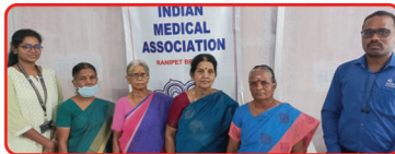
IMA Ranipet Branch