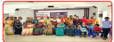
IMA Palani Branch