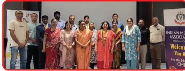
IMA Chennai Velachery Branch