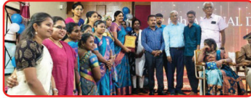
IMA Erode Branch