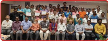
IMA Kanchipuram Branch