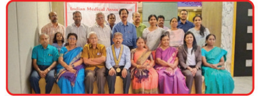
IMA Chennai Villivakkam-Ayanavaram Branch