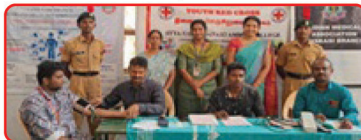
IMA Sivakasi Branch