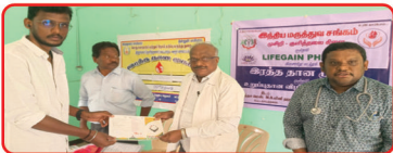
IMA Musiri - Kulithalai Branch