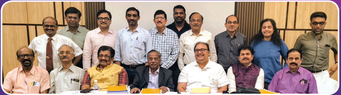
IMA TNSB Finance Standing Committee Meeting at Coimbatore on 04.05.2025