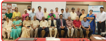
IMA Poonamallee High Road Branch