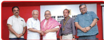
IMA Nagercoil Branch