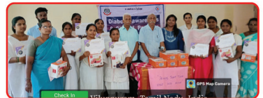
IMA Villupuram Branch