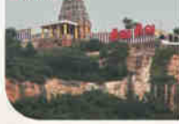
The Famous T-gode Arthanareeswar Temple