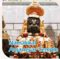
Namakkal Anjaneyar Temple