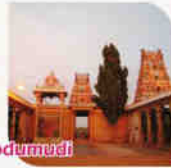
2000 Years Old Brahma Temple, Kodumudi