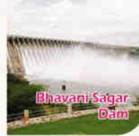
Bhavani Sagar Dam