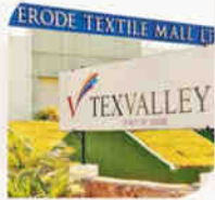
South India's Largest Textile Market Texvalley