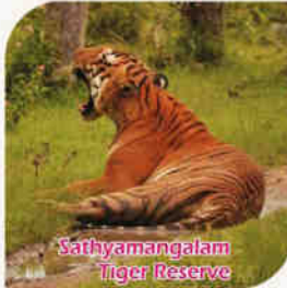
Sathyamangalam Tiger Reserve