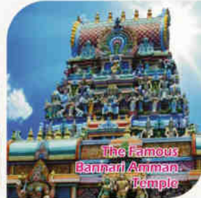
The Famous Bannari Amman Temple