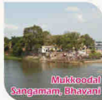
Mukkeodal Sangamam, Bhavani